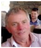
Georgie Grieve Committee