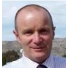
Rex Verry Committee