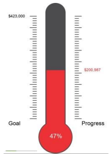
Court 4 funding

Junior Club Night 5pm – 7pm Fridays in School Term, $5, Free for members Small Nix (5-8 year olds) 5pm – 5:30pm Fridays in School Term, No Charge Senior (Adults) Club Night Fridays in school term 7pm – 9pm No Charge Mums N Bubs Thursdays from 9:30am – 11am $5 non members,