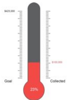
Court 4 funding

Mums N Bubs Thursdays from 9:30am – 11am $5 non members,