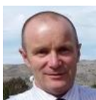
Rex Verry Committee