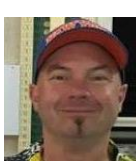
Richie Hoare Development